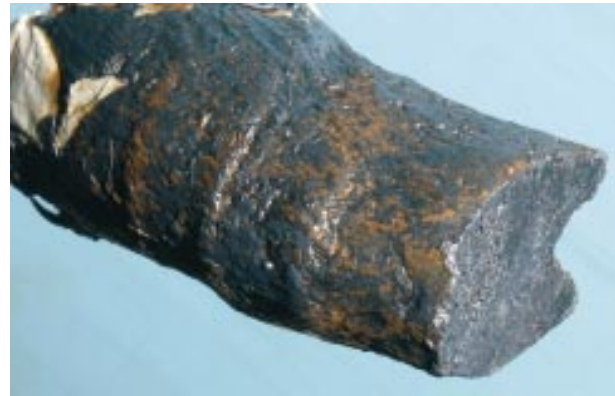
Figure 1 Bovine larynx after being filled by melted lead.